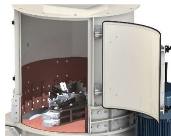
Large maintenance door for optimal accessibility