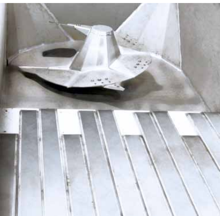
BIG-Mix Push strips with mixing area

The energy efficient BIG-Mix is a versatile dosing unit used for storing and processing a wide variety of substrate materials for biogas plants. The BIG-Mix stands out due to the low amount of energy required for large feed volumes of difficult substrates. The distinctive feature consists of stainless steel push strips individually driven by hydraulic cylinders. These push strips transport the substrate into a connected mixing and dosing area. The material is processed and then transferred to subsequent conveyor screws by a vertical mixing screw. This push floor system allows for the easy processing of difficult substrate material, such as 100% grass silage, solid manure, green waste etc. Volume capacities of 45 – 200 m 3 are available.