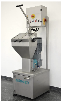
Highest level of safety due to automatic switchoff

According to the revised Annex V of the MARPOL convention, food waste from ships or offshore platforms may only be discharged into the sea in certain maritime areas if the waste is no larger than 25 mm.