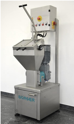
Highest level of safety due to automatic switchoff

According to the revised Annex V of the MARPOL convention, food waste from ships or offshore platforms may only be discharged into the sea in certain maritime areas if the waste is no larger than 25 mm.